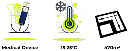
Medical Device 15-25°C 470m 2

GA Health – the home of infection prevention in endoscopy. GA Health design, develop, and manufacture Medical Device products including a wide range of high-performance valves, connectors and tubing. Using decades of experience and industry knowledge, GA Health strive to improve lives through increasing the efficiency and reducing the infection possibilities in endoscopic procedures.